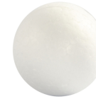
Polystyrene Balls, D: 3 cm, white, polystyrene, 10pcs 543011