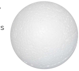
Polystyrene Balls, D: 3 cm, white, polystyrene, 100pcs 543012