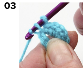
Crochet 10 double crochet stitches around the ring and finish with a slip stitch.