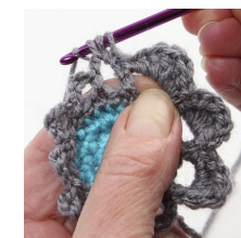
C A 1/2 basic treble stitch.