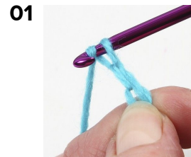
Crochet 4 chain stitches.

This flower is crocheted from cotton yarn in two colours using a No. 4 crochet hook.