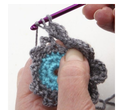
D A basic treble stitch.