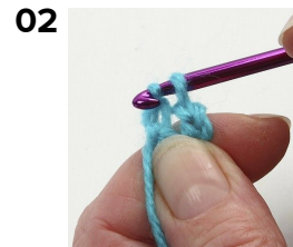
Make a ring by finishing with a slip stitch in the first chain stitch.