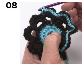
Finish the flower with a row of chain stitches along the border in the same colour as the colour used in the middle of the flower.