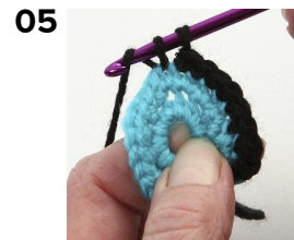
Change to a different colour yarn and crochet 1 double crochet stitch into each stitch all the way around. Finish with a slip stitch.