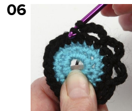
In the next round crochet 4 chain stitches, skip 2 double crochet stitches and crochet down with a slip stitch. Repeat all the way around the ring, making 10 arches in total. □