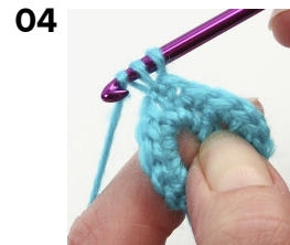
In the next round crochet 2 double crochet stitches into each stitch. Finish with a slip stitch.