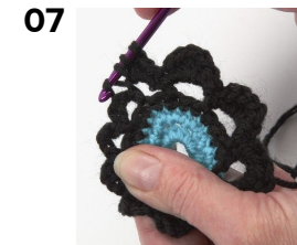
Crochet in each arch: 1 double crochet stitch, a 1/2 basic treble stitch, 3 basic treble stitches, a 1/2 basic treble stitch, 1 double crochet stitch. Follow this procedure for all the arches all the way around the ring. Finish with a slip stitch in the first stitch of the round.