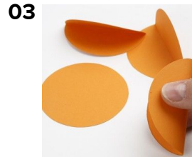
03 Fold the circles in the middle.