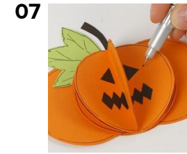
07 Draw a face with the Medallion pen. Finally make a hanging decoration hanging on a thread.