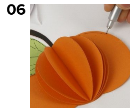
06 Glue the leaves onto the pumpkin and draw details with the Medallion pen.