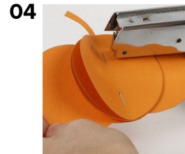
04 Put the circles on top of one another on the pumpkin and staple them securely in the crease.