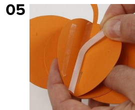
05 Attach double-sided tape on the top circle and fold them together, so it hides the staples.