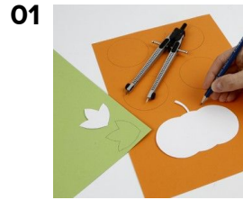
01 Draw the templates onto the card.

Cut out scary hanging decorations from card using templates and staple them together. Decorate with a white Gel pen and a black Medallion pen.