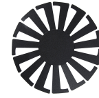
Basket Weaving Template, D: 8 cm, H: 6 cm, black, 10pcs 47453