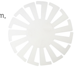
Basket Weaving Template, D: 14 cm, H: 8 cm, transparent, 10pcs 47450