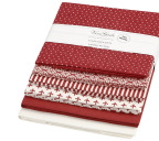
Cotton Fabric, size 45x45 cm, 140 g/m2, Copenhagen, 6pcs 44153