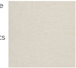
Fleece, L: 125 cm, W: 150 cm, off-white, 1pc, 200 g/m2 44620