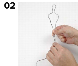
02 Shape the Bonsai Wire.