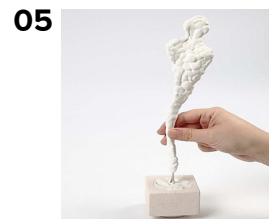
05 Push the sculpture into the candle holder stand.