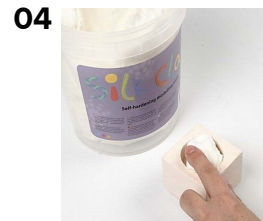
04 Push a lump of Silk Clay into the candle holder stand.