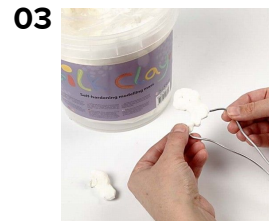
03 Push small pieces of Silk Clay onto the wire.