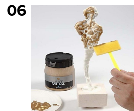
06 Paint the sculpture and the stand with a flat foam brush.