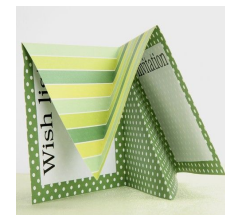
An alternative picture.