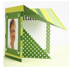
An alternative picture.

07 Cut two pieces of card 10 x 10cm and 5 x 5cm for menu and place cards respectively. Fold and decorate these using the same technique. Attach the small folding cards onto the cards using double-sided adhesive tape.