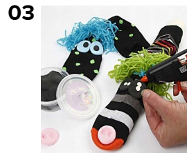
03 Make the eyes from Silk Clay. Glue them onto the sock using a glue gun. Put paper inside the stocking to avoid burning your fingers.