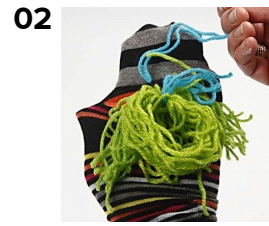
02 Sew the yarn onto the stocking.