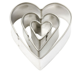
Metal Cutters, largest size 40x40 mm, heart, 3pcs 78786