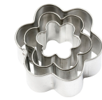
Metal Cutters, largest size 40x40 mm, flower, 3pcs 78787