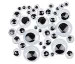
Googly Eyes, D: 4-20 mm, , self-adhesive, 1100mixed 50116