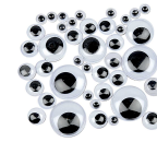
Googly Eyes, D: 4-20 mm, , not sticky, 1100mixed 50122